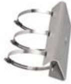
Vertical Pole mount DS-1275ZJ