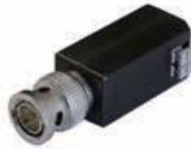
DS-1H18 Video Balun